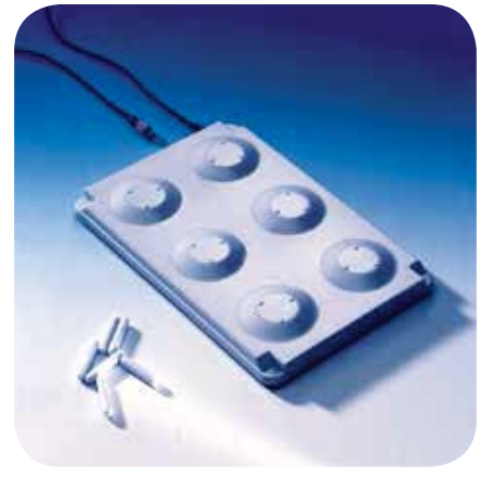
Inductive stirring system

The microprocessor-controlled Lovibond® inductive stirring system is non-wearing and maintenance-free. In other words, there are no moving parts in the system.