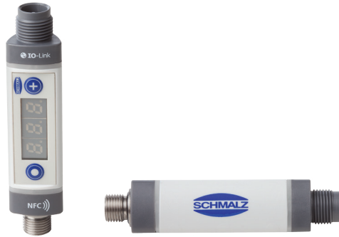
Vacuum and Pressure Switches VSi